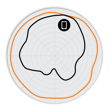
Figure 2. R650 2.4GHz Azimuth Antenna Patterns