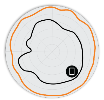
Figure 3. R650 5GHz Azimuth Antenna Patterns